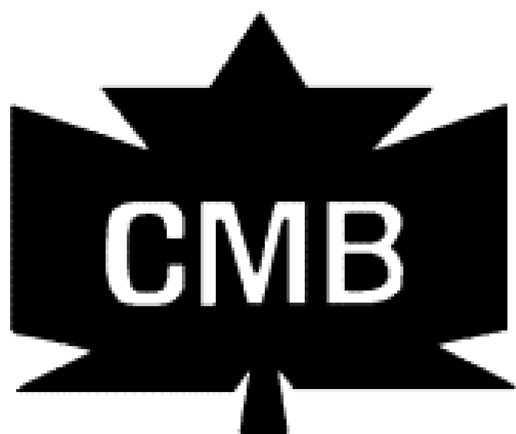
Canada Mink Breeders Association