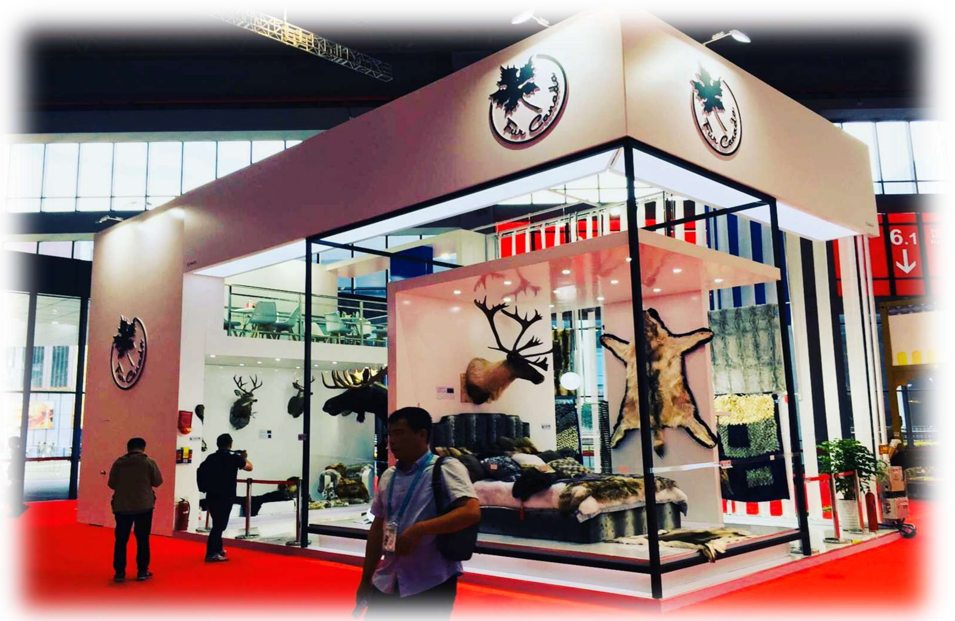
FurCanada Booth at China International Import Expo 2019, Shanghai

His work experience includes tenures with The House of Dior, Givenchy, Balenciaga, Saga Furs of Scandinavia (Design Director 1996-2000) Studio NAFA (Director 2007-2014) with a myriad of engagements and accomplishments within the entire spectrum of the Greek Fur Industry. Including Project Director of the Greek Summer Fur School. Innovated, created, constructed and lead many fur projects throughout Europe & the World.